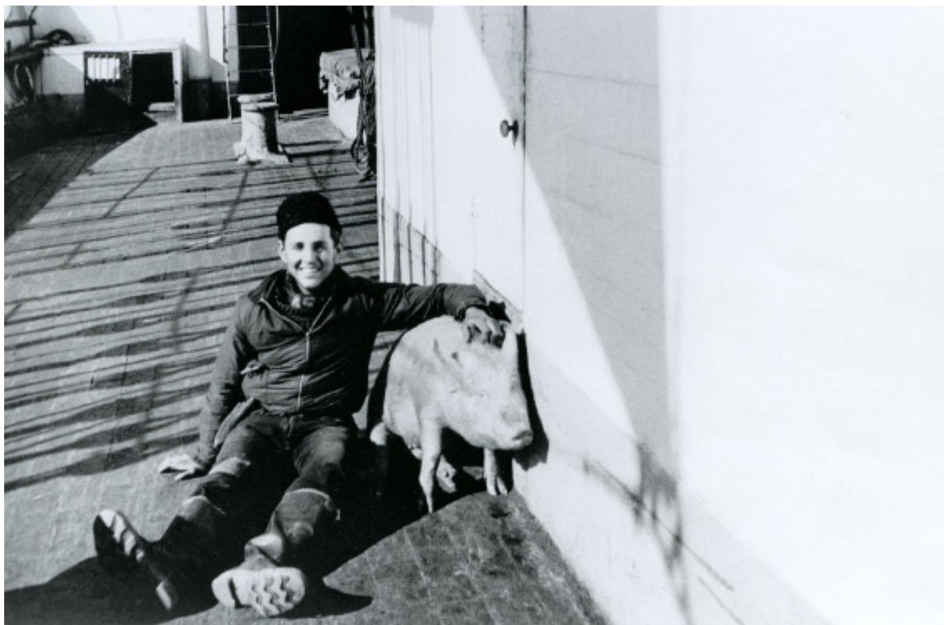
Eric Newby on board Moshulu

In 1938 aged eighteen, Eric Newby signed on the 4-masted barque Moshulu for a round voyage to Australia from the UK. She was one of the largest sailing ships ever built, at around 320ft on the waterline and 3,200 gross tons. Constructed in Glasgow in 1904, she was sold in 1935 to Gustaf Erikson of Mariehamn in the Swedish Åland Islands.