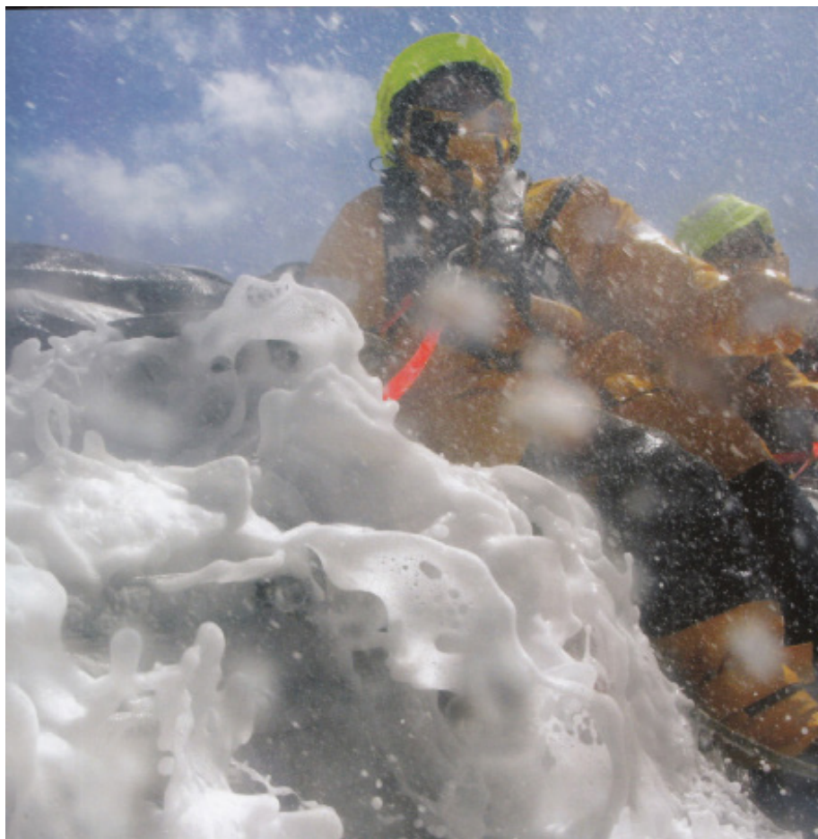
An exacting and exhilarating race

Chisnell's book deals with the 2008 race; 37,000 miles through ten stages across the world's seas and oceans. The boats, the Volvo Open 70 - capable of sustaining speeds of well over 30 knots - and the course made this the most exacting of all crewed sailboat races. Many sucked their teeth and prophesied doom as they contemplated the swing keels, daggerboards, minimal displacement and no compromise. But without someone sticking their neck out, progress is made only slowly, if at all, and these yachts certainly stretched the limits. Although blisteringly fast, they did indeed prove structurally questionable.